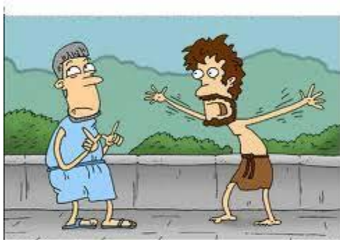
Jonah attempts to share his tale with doubting Thomas

Cleaning out your garage this spring, or going to garage sales? Keep your eyes open for good used fishing tackle, poles, etc. The Social Ministry Committee is sponsoring a Tackle Drive for the State Training School for Boys in Eldora. The gear will be used by the chaplain as he teaches the boys about the patience and self reliance of fishing. Help be a “fisher of men” and give these young men a second chance. New items also welcome. Place your contributions in the blue tub marked “Tackle Drive”.